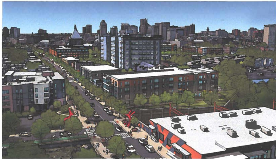
View of Greenmount Avenue and Hoffman Street