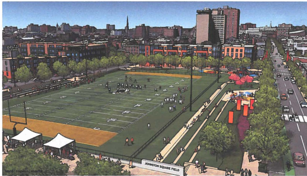
View of proposed Johnston Square Field