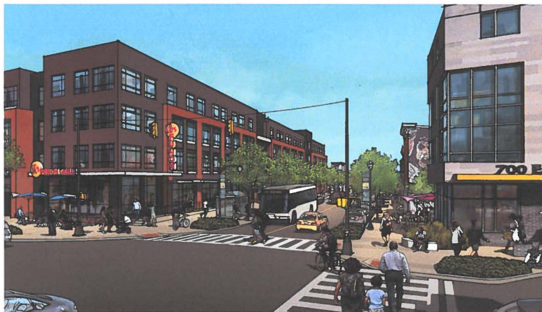
View of the 1100 Block of Greenmount Avenue and East Chase Street