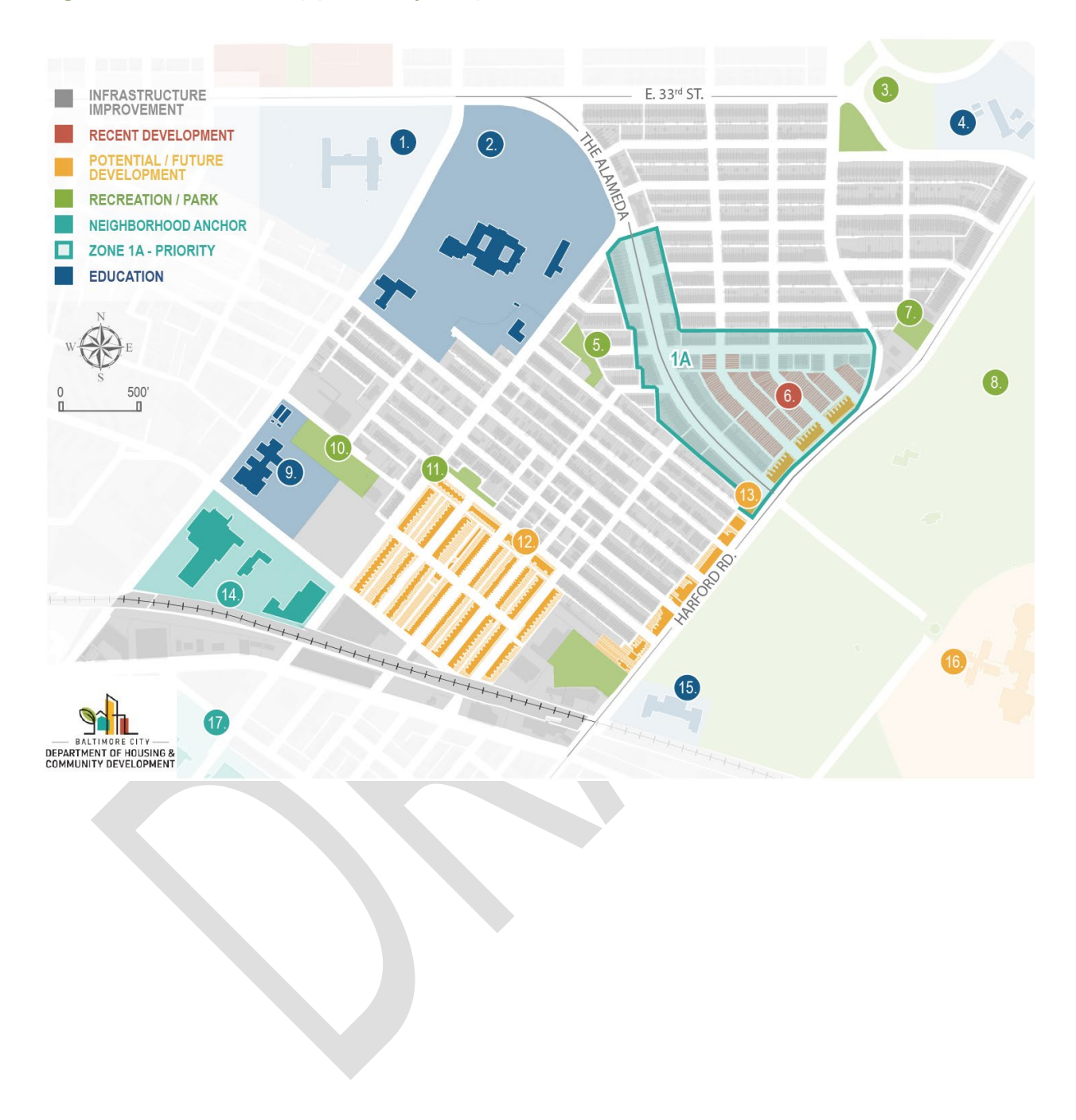
Figure 3, Asset and Opportunity Map