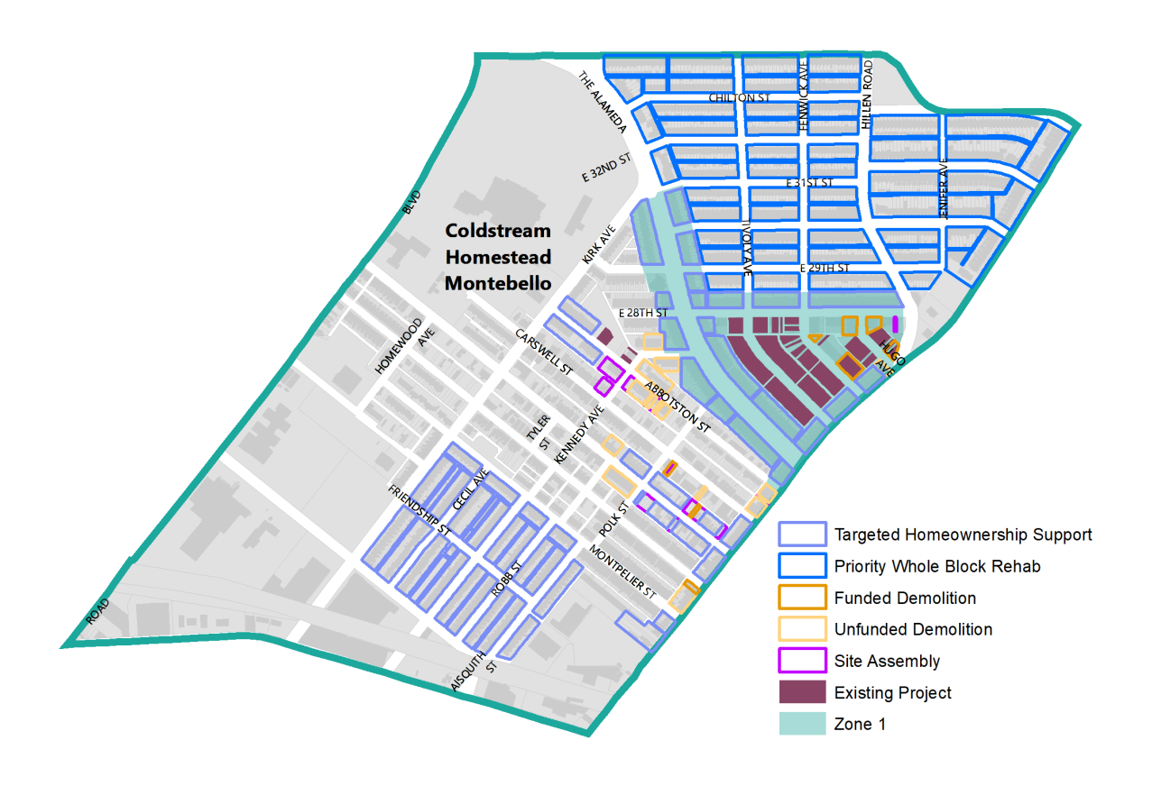
Figure 5, Comprehensive Block Level Planning in the CHM IIA