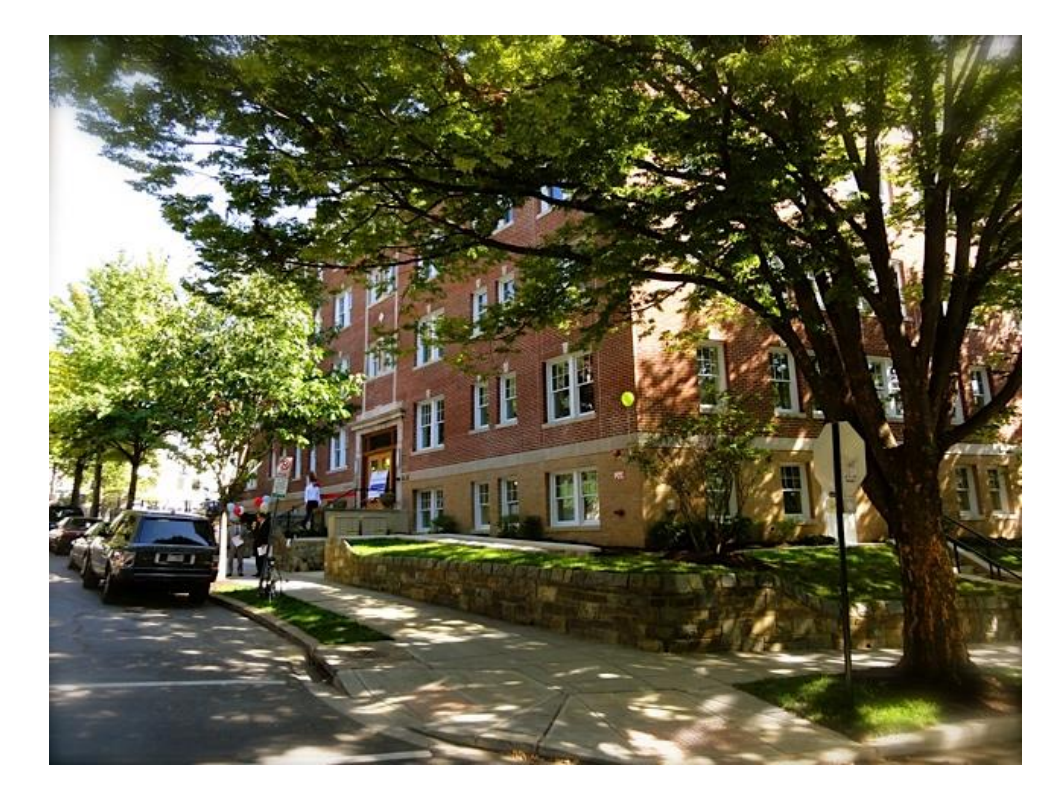
St. Dennis Apartments in Mt. Pleasant

Criteria include HPFT affordability criteria, as well as preferences for family-sized units; Permanent Supportive Housing (PSH) units; senior housing, mixed-income projects; TOPA projects, and projects near transit.